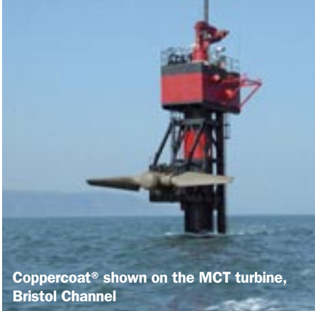
Coppercoat® shown on the MCT turbine, Bristol Channel

Anti-foul companies are rightly under increasing pressure to produce coatings that are environmentally sensitive as well as effective. Not only is Coppercoat® tin-free and fully compliant with all current anti-fouling legislation, including International Maritime Organisation (IMO) Resolution MEPC.102(48), but originating in the latest water-based epoxy technology allows the resin to be VOC (Volatile Organic Compound) free also. Consequently Coppercoat® gives off no toxic fumes or unpleasant smells and is certified for use by professionals and the general public alike. Furthermore, the cleaning solution for Coppercoat® is simply water.