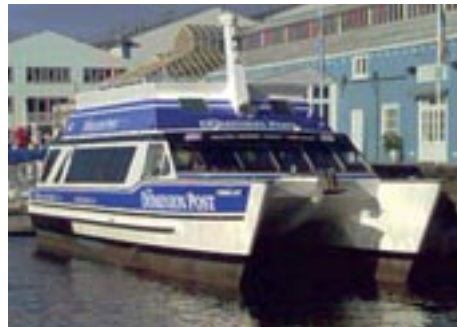
50ft composite passenger ferry – New Zealand.