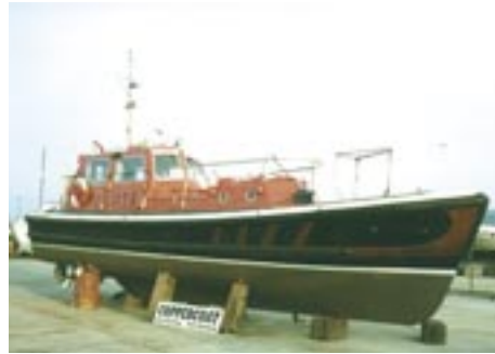
42ft GRP pilot vessel – UK.