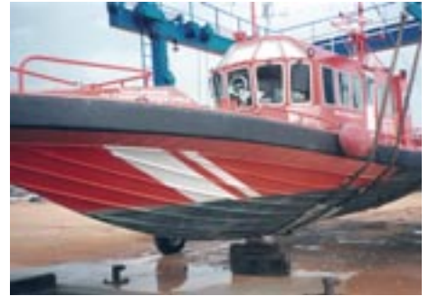
36ft aluminium patrol boat – Spain.