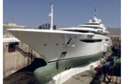
410ft steel megayacht – Abu Dhabi.

Hard-wearing Coppercoat® gives longer service intervals, allowing vessels to stay in-water and stay working, with obvious economic benefits.