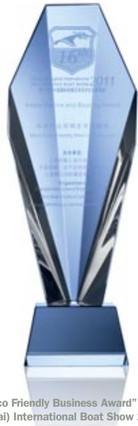
“Most-Eco Friendly Business Award” China (Shanghai) International Boat Show 2011

For those looking to minimise the environmental impact of their anti-foul, Coppercoat® can provide the solution.