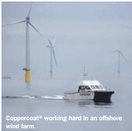
Coppercoat® working hard in an offshore wind farm.