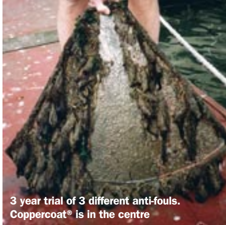
3 year trial of 3 different anti-fouls. Coppercoat® is in the centre

Coppercoat® uniquely provides lasting protection against marine fouling whilst secreting very low levels of biocide. With a leach rate of less than 50micrograms/cu/cm2 after 30 days, Coppercoat® complies with the requirements of even the most tightly controlled locations, such as the states bordering the Baltic and, in the USA, California. Consequently a vessel treated with Coppercoat® can sail freely in all waters of the World, and given the hard-wearing longevity of the coating, the dream of circumnavigating the globe on a single treatment of anti-foul is now a reality.