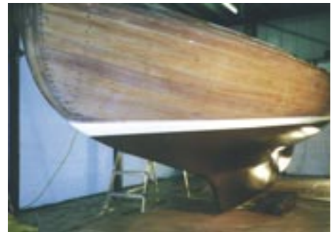
Wooden XOD sprayed for racing finish.