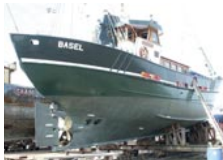
70ft steel fishing boat – Ireland.