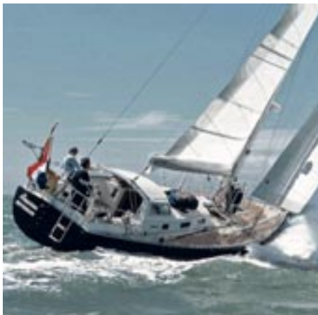
Coppercoat® treated 'Arearea' at Cowes Week.

Coppercoat® is suitable for DIY application by roller and by being non-conductive can be used (with the appropriate primer) on all surfaces including GRP, cast iron, steel, wood, ferrocement and aluminium.